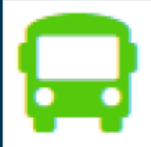
School Bus Stop

is pleased to offer the "School Bus Stop" which is located on our website at www.sd23.bc.ca